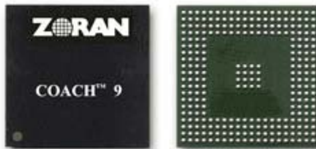
C9m/C9P: 17mm x 17mm C9s: 13mm x 13mm